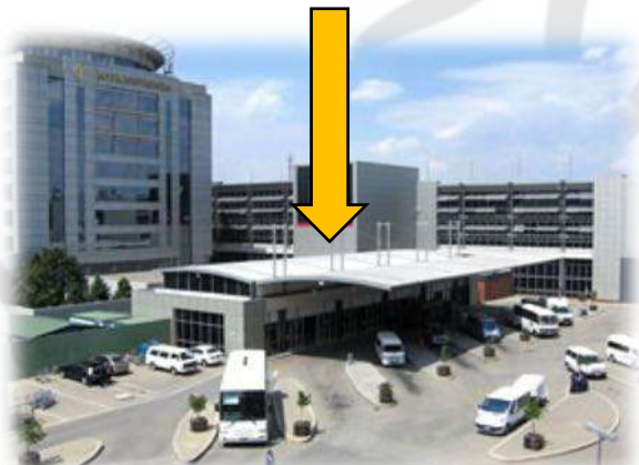
Johannesburg Airport Bus Terminal

You will need to walk through the arrivals hall to the bus terminal.