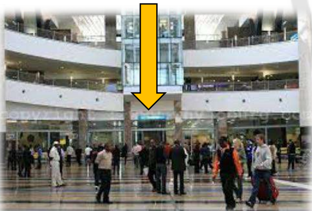
Johannesburg Airport Arrivals Hall

You will need to walk through the arrivals hall to the bus terminal.